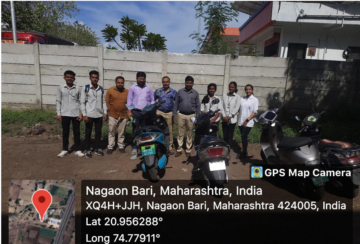
USE of E-Bikes from Students and Faculty

DCS's Annasaheb Ramesh Ajmera College of Pharmacy